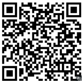
GC Registration Help Code

A full video tutorial of the registration process can be accessed HERE or by entering the URL below into your web browser. In addition, you may access the Full Tutorial by scanning the QR Code below https://groupcollect.helpscoutdocs.com/article/247-parents-guradians-how-to-register-your-child-for-a-trip